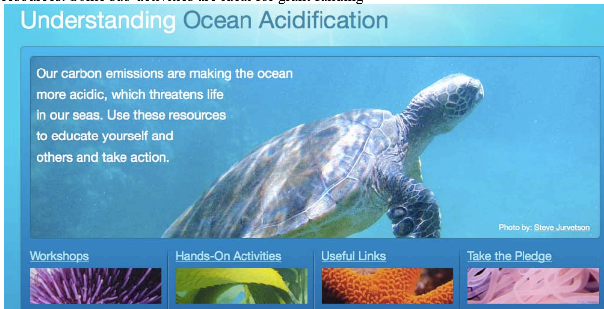
Figure 2. Screen Shot of Understanding Ocean Acidification Web Site, http://cisanctuary/acidoccean Strategy 4: Mitigating Damages to Sanctuary Resources

Year 5: $125K including $70K for 2/3 time FTE to implement OA Education, $15K evaluation, $40K determine based on evaluation, what activities programs and work best and implement, analyze data, produce evaluation report. Limited progress can be made with existing staff resources. Some sub-activities are ideal for grant funding