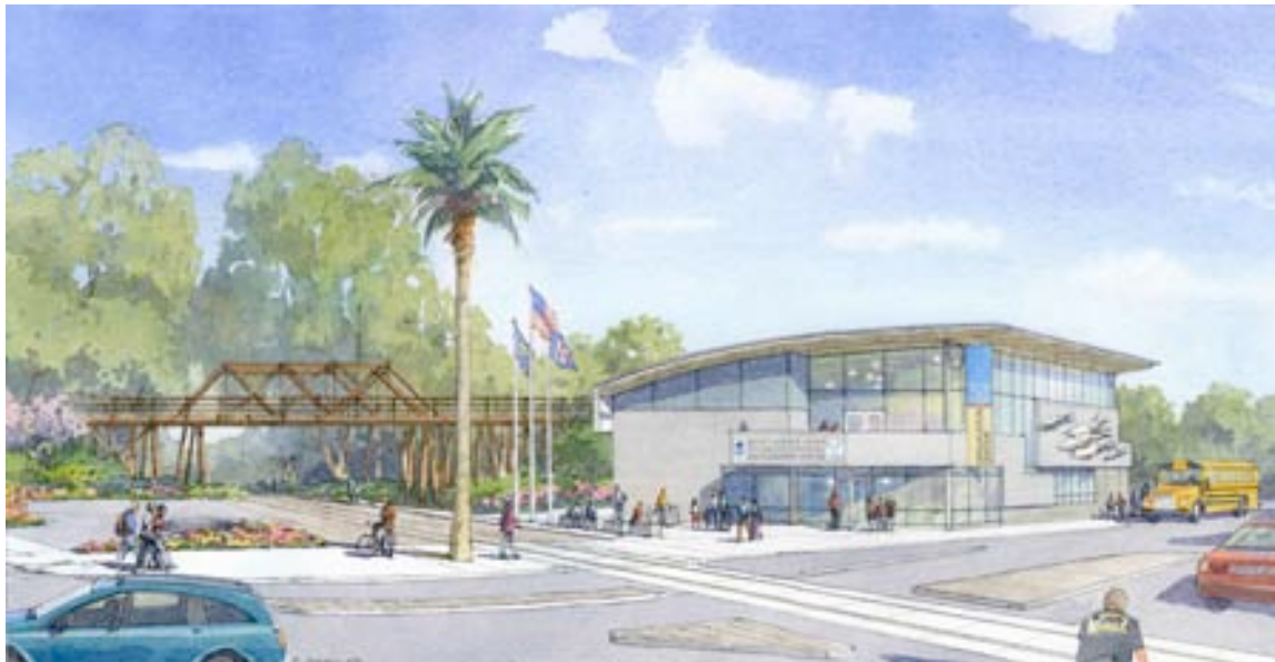
Figure 3. Depiction of the MBNMS Santa Cruz Exploration Center currently under construction using LEED® building standards.