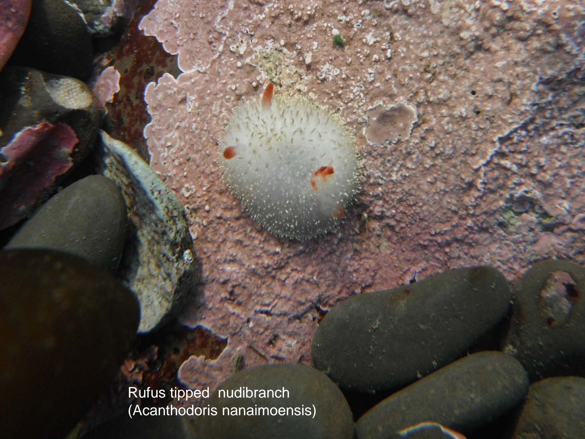
Rufus tipped nudibranch ( Acanthodoris nanaimoensis )