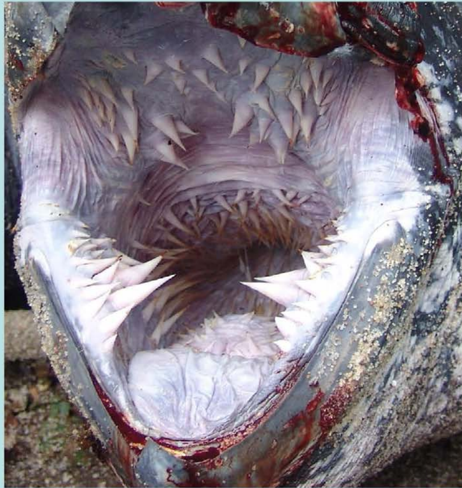
Kyle Hill's Science-Based Life Blog

The leatherback's mouth and throat have fleshy lobes for grasping jellies.