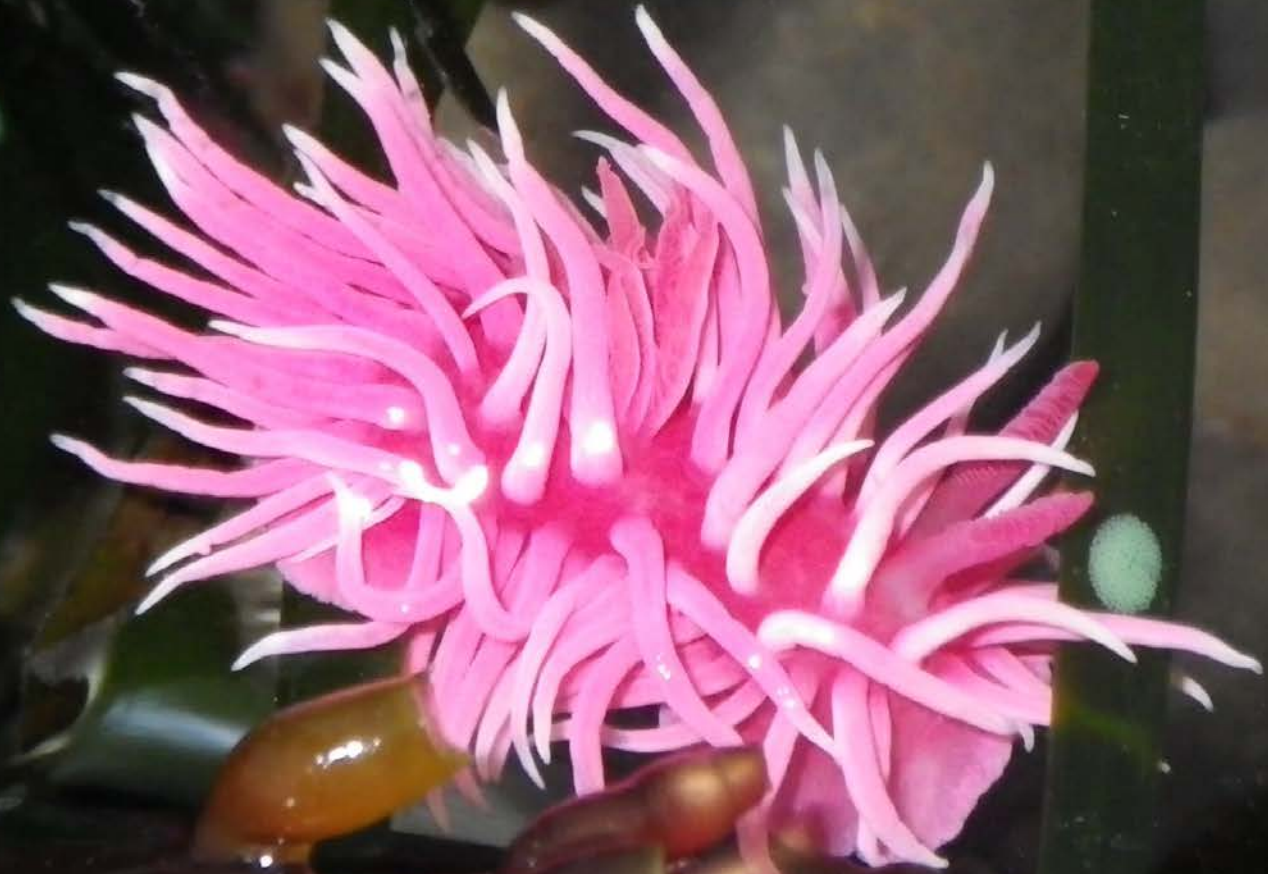
• Hopkins Rose ( Hopkinsea rosacea )